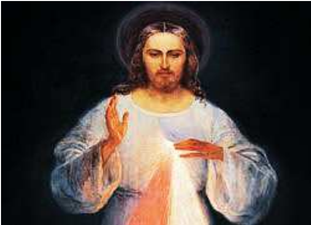
Image of the Divine Mercy of Jesus